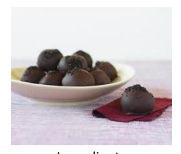
Ingredients 1 16oz package of OREO Cookies 1 8oz Package of Cream Cheese 2 8oz Packages of Melting Chocolate of your choice (White, Semi-Sweet)

Crush 9 of the cookies to fine crumbs in food processor; reserve for later use. (Cookies can also be finely crushed in a resalable plastic bag using a rolling pin.) Crush remaining 36 cookies to fine crumbs; place in medium bowl. Add cream cheese; mix until well blended. Roll cookie mixture into 42 balls, about 1-inch in diameter.